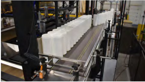
Dual Lane Discharge Conveyor