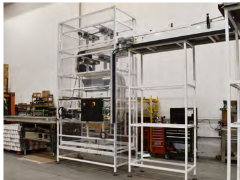
S-Style Side-Grip Lowerator

Ska Fab side-grip lowerators are an efficient way to safely decline your containers from high elevations. The small footprint saves valuable floor space and the tool-less adjustability makes line changeovers quick and easy. Elevation heights for containers entering side-grip (top) and discharging (bottom) are built to customer specifications.