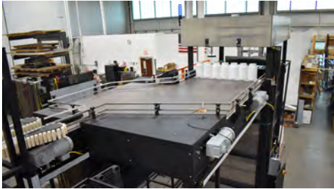
Bi-Directional Mass Accumulation Table

Accumulation tables and conveyors are designed to hold and move your plastic and metal containers at different points during the conveying or packing process. Ska Fab will help you pair your depalletizer with the right discharge conveyor to meet your speed and space requirements.