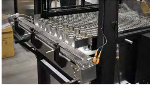
Single Lane Discharge Conveyor