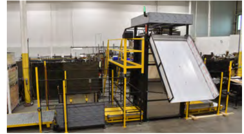
Bottle Chute (used with customer owned hopper)