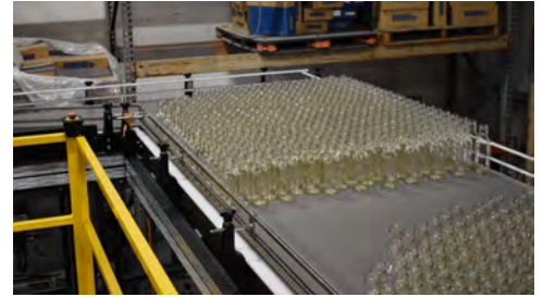
High Speed Single Filer with Mass Accumulation Table